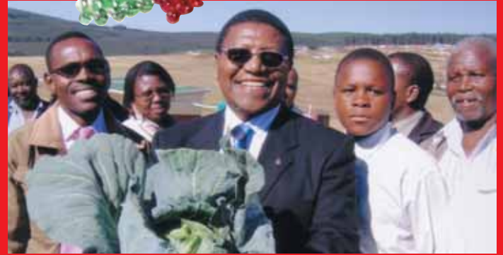
KZN's former Minister of Agriculture with a cabbage grown from Gumboots' seeds

The accommodation is ready and the staff are on standby for Khazimula Orphanage to open its doors in December (as soon as funds are available from social welfare). This will be wonderful beginning for the 18 to 20 orphaned children and streetkids who have been chosen to share this beautiful space.