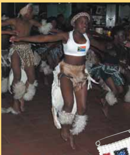
In traditional action