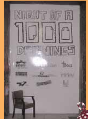
The entrance to the exhibition

Despite BHP Billiton's donation of R30 000 towards the event, Paballo took home R66 000, after expenses. The remaining drawings will be hung in the Paballo room. Log onto the "Night of 1 000 Drawings" blog ( http://1000drawings.blogspot.com/ ) to see pictures and get the low-down on the event.