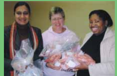
"Working on Fire" team with Gumboots' seeds

Within the first year of operation, 40 fire-fighting bases had been established, each with over 20 hand fire-fighting crews in place. Outside of the fire season, these teams are active with fire prevention work and community awareness programmes. Part of each team's spare time is spent teaching rural schoolchildren in KZN about the danger and control of fires, HIV/AIDS information, and how to grow plentiful supplies of vegetables by establishing school gardens. And this is where the Gumboots Seedbank comes in... the teams fly in helicopters to the various rural schools and communities and hand out the free seed packets while they educate the children. They encourage local communities to care for the land, grow their own produce, and improve their health by consuming a wide variety of nutritious and locally produced vegetables.