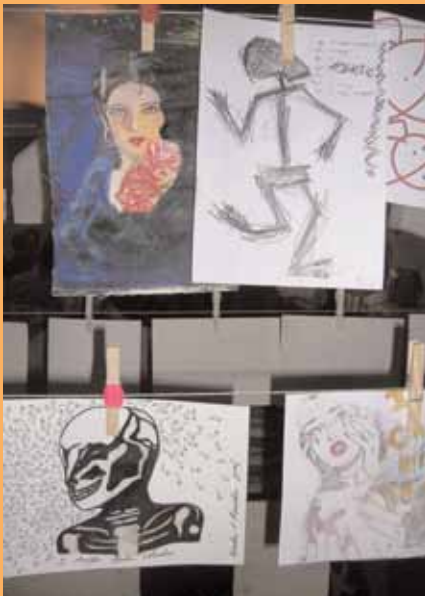
Some of the drawings sold on the successful night