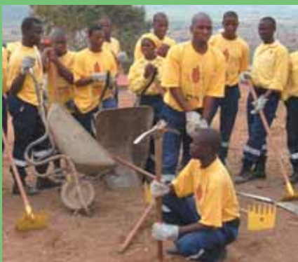
Young learners planting seeds

The Gumboots Foundation is proud of the part its Seedbank in Khazimula is playing in supporting another initiative. The "Working on Fire" Programme, launched in 2003 with combined aid from government and the commercial forestry sector, provides training and work opportunities for young people and develops teams to prevent and fight fires.